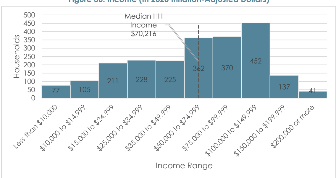
Figure 3B: Income (In 2020 Inflation-Adjusted Dollars)

Figure 3B provides data at how household incomes range.